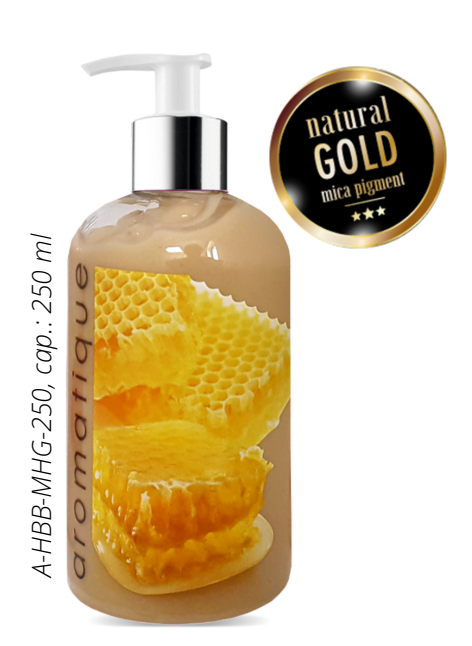
Milk & Honey